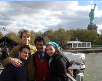
On the ferry to Ellis Island (The Statue of Liberty)