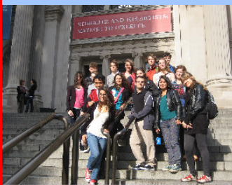
On the steps of the Metropolitan Museum of Art

“Make crime pay. Become a lawyer.” -Will Rogers