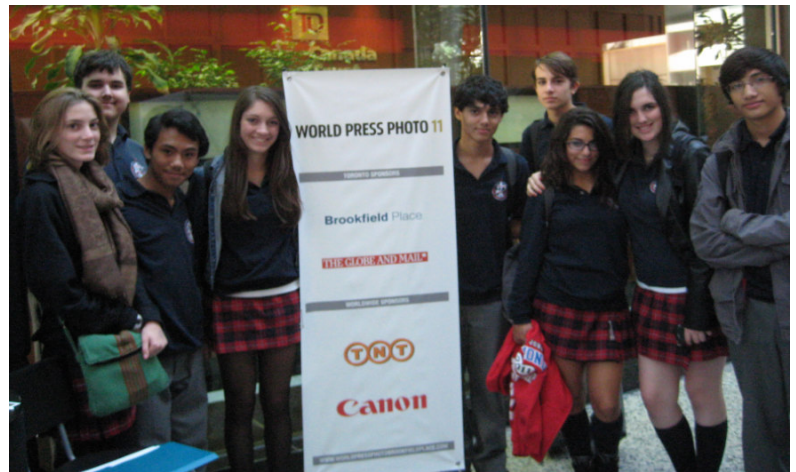
FJR students at the World Press Photo

"Of all of our inventions for mass communication, pictures still speak the most universally understood language."