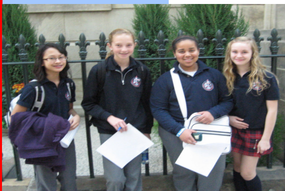
FJR students at the World Press Photo