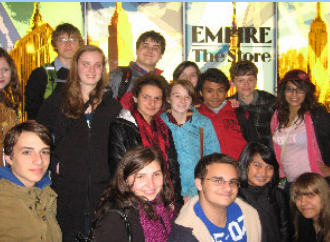
Our night at the Empire State Building