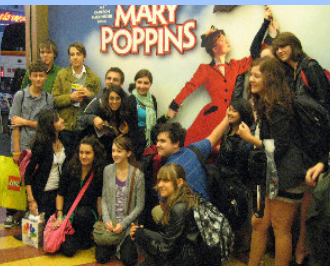
Mary Poppins on Broadway