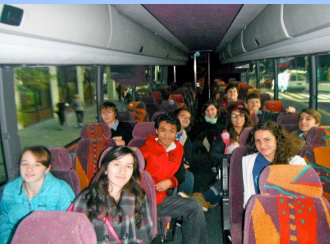
On the bus to New York City