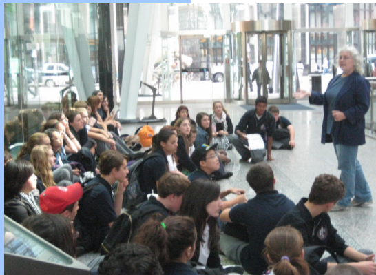
FJR students at the World Press Photo