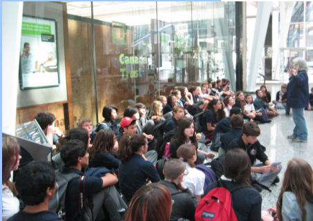
FJR students at the World Press Photo