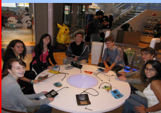
Nintendo World in New York

“Experience, travel - these are as education in themselves.” -Euripides